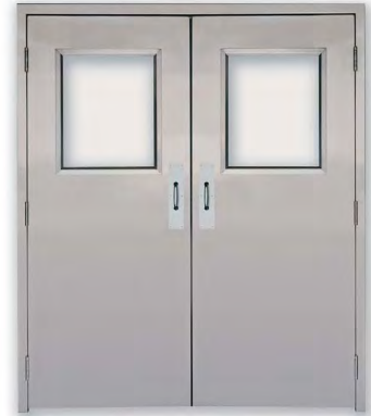
Paired Swinging Stainless Steel Door