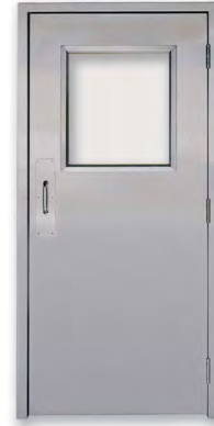
Single Swinging Stainless Steel Door

With over 40 years of combined experience, our professional sales consulting team will ensure your mission-critical requirements, while maintaining our uncompromising dedication to quality and value added service.