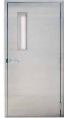
Single Swinging UL Rated Fire Door

With over 40 years of combined experience, our professional sales consulting team will ensure your mission-critical requirements, while maintaining our uncompromising dedication to quality and value added service.