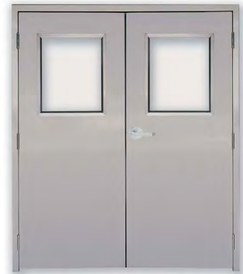
Paired Swinging UL Rated Fire Doors